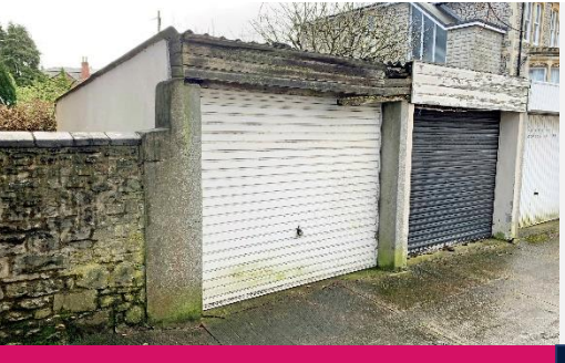
Guide Price: £15,000 - £20,000

Garage on Rockleaze Avenue, Sneyd Park, Bristol BS9 1NQ