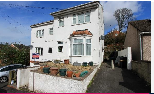
Guide Price: £120.000+

Flat 4 Valma, Court, 206 Dundridge Lane, St George BS5 8SX